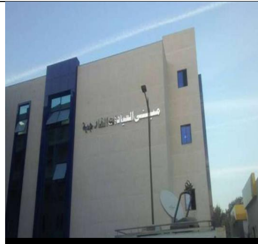
4. Building of outpatients clinics