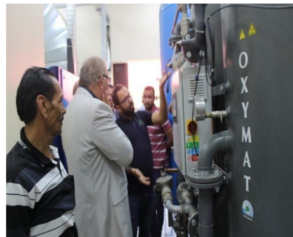
3. oxygen generating station