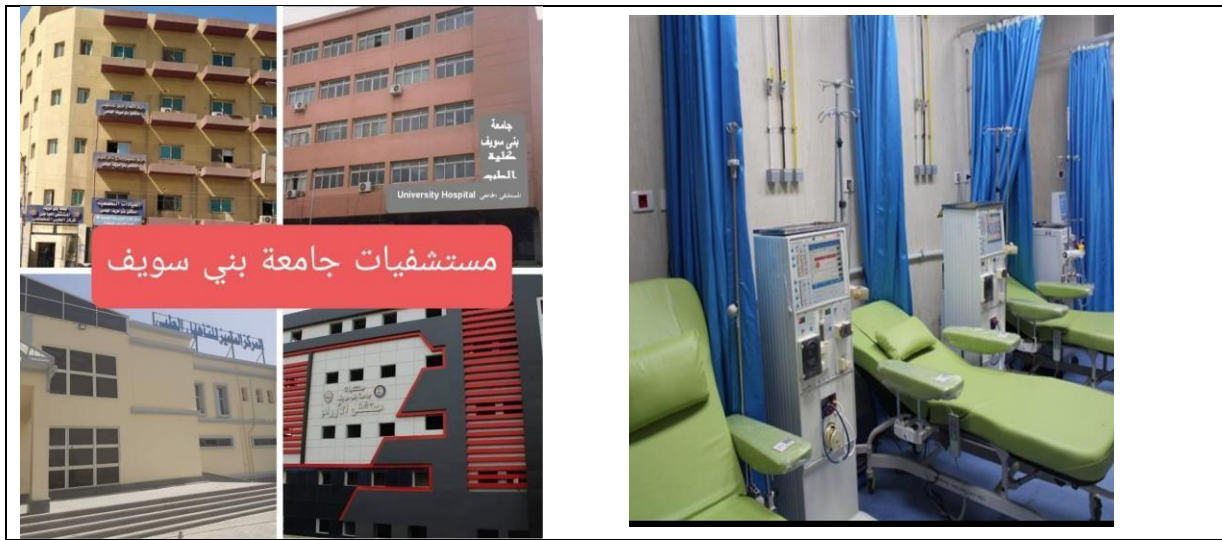
1. Beni-Suef University Hospitals

Health care services facilities for students, academics and administrative staffs' wellbeing